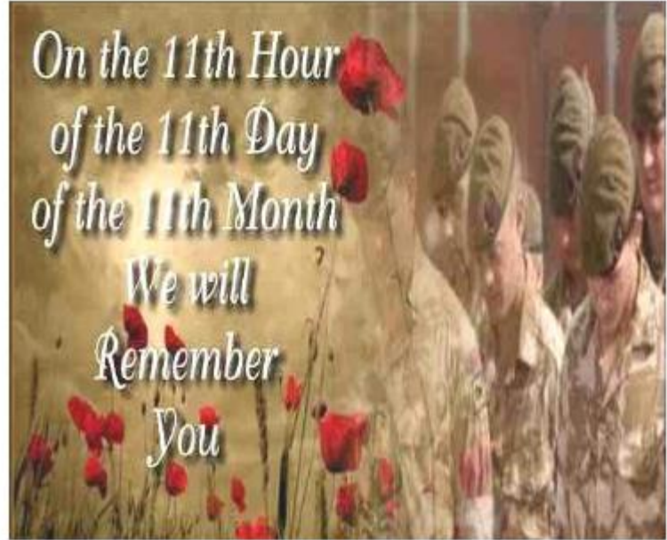
REMEMBRANCE DAY SERVICE NOVEMBER 11, 2018 10:30 AM CUPAR TOWN HALL

EVERYONE WELCOME LUNCH TO FOLLOW SERVICE IN THE HALL